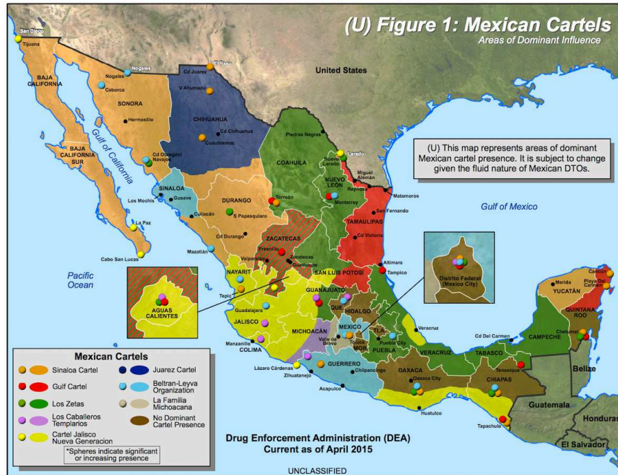
Figure 1. Mexican Cartel Areas of Dominant Influence According to DEA. This map shows areas of cartel dominant influence according to DEA as of 2015.